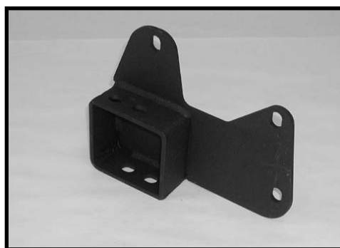
F404 / Qty. 1 Passenger side radius arm relocation bracket