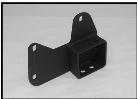
F403 / Qty. 1 Driver side radius arm relocation bracket

If you have any questions or concerns, please feel free to contact Tuff Country or your local Tuff Country dealer.