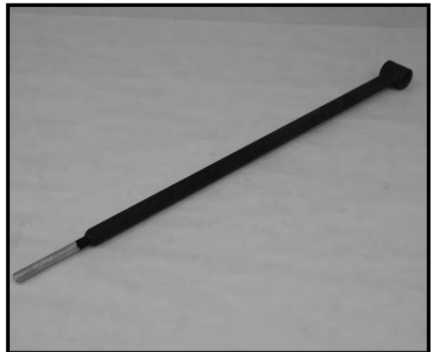
RTB-01 (2) Rear traction bar