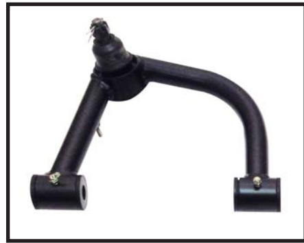
53905-02/ Qty. 1 Passenger side upper control arm