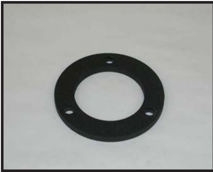
52907-02 / Qty. 2 Strut Pre-load spacer