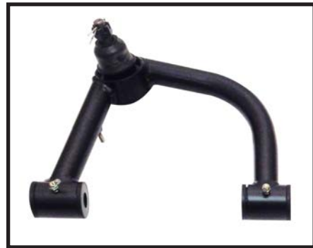
53905-02/ Qty. 1 Passenger side upper control arm