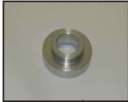
52907-01 / Qty. 2 Upper Strut Spacer