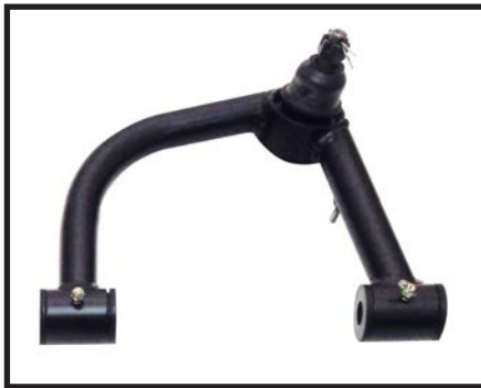
53905-01 / Qty. 1 Driver side upper control arm