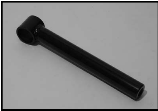
30945-01 / Qty. 2 Upper control arm