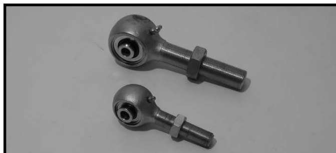
HEIM-01 / Qty. 2 HEIM-02 / Qty. 2 Large and small Heim joints