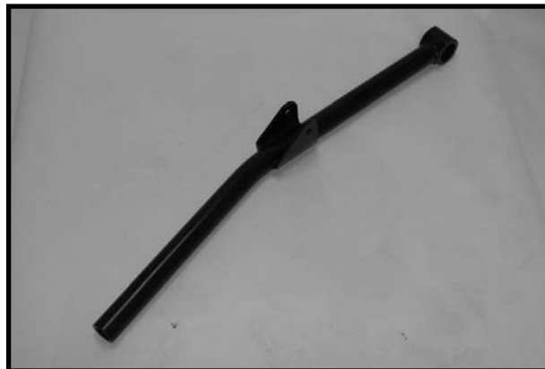
30940-13 / Qty. 1 PS lower control arm