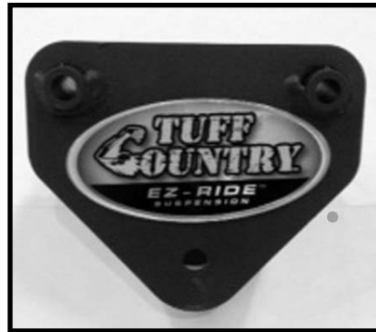
30945-04 / Qty. 2 DS & PS frame mounts