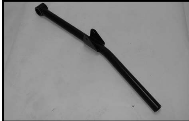
30940-12 / Qty. 1 DS lower control arm