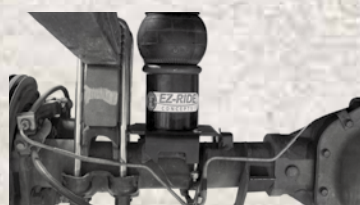
Air Bag Spacers