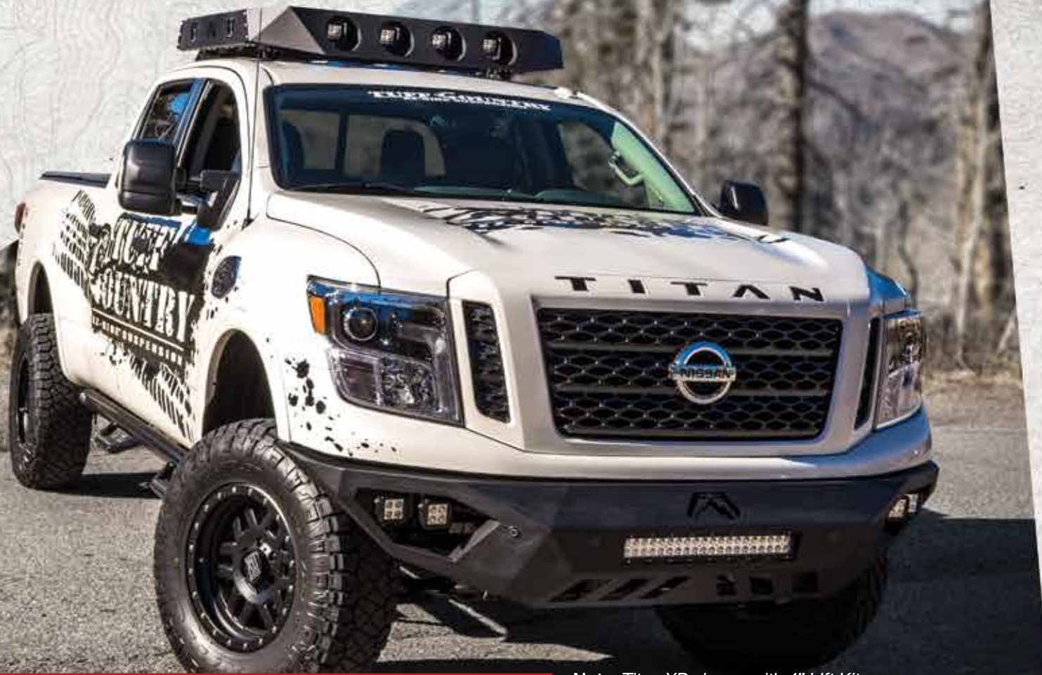
Note: Titan XD shown with 4" Lift Kit