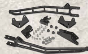
Extended Radius Arms