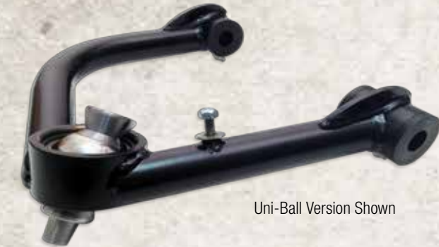
Uni-Ball Version Shown