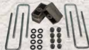
Lift Block Kits