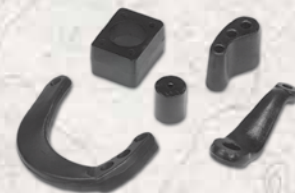
Pitman Steering Arms