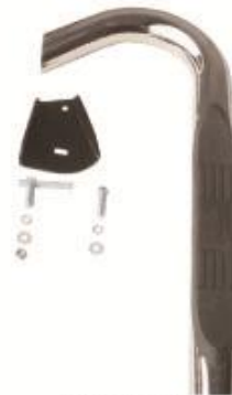
PASSENGER FRONT - LADO DEL PASAJERO, DELANTERO - PASSAGER AVANT -