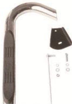
DRIVER FRONT - LADO DEL CONDUCTOR, DELANTERO - CONDUCTEUR AVANT -