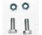
Ladder Assembly Fasteners