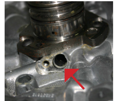
ISS Sensor Hole (1)

The ISS D74438G is a long probe, which extends through a hole in the pump cover casting to read the input shaft reluctor RPM. Always ensure that the O-ring is in position or leaks will occur. The sensor pigtail connects to the TCC harness. (1)