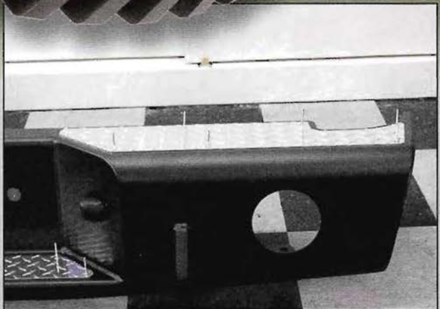
Before securing the top plates to the bumper, I testfit them in place and secured them with the rivets provided in the kit. Then the PIAA 510 Super White driving lights and trailer light mounting plate were installed.