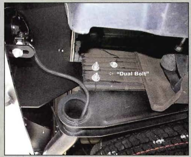
The bumper is secured to the frame using the dual-bolt system and an additional bolt. A replacement nut and bolt is provided for securing the frame to the receiver hitch that was incorporated into the stock bumper.