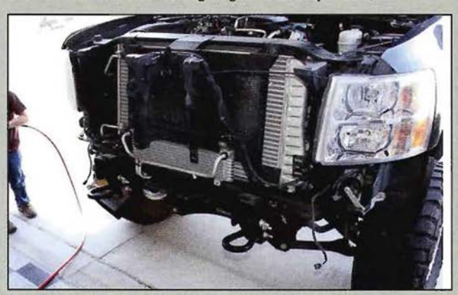
The stock bumper is held in place by six bolts that secure it to the frame. Retain the two dual bolts for use with the new bumper. I disconnected the electrical connector for the foglights and removed the bumper from the truck.