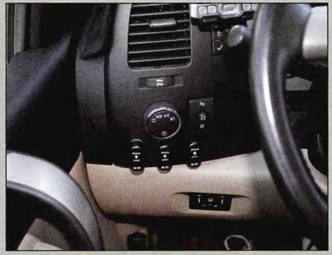
The light switches are routed through the knee panel and secured under the main light switch. Once all the wires were routed and the switches were in place, the installation was complete, but the project wasn't. PIAA offers instruction for the proper control and alignment of the driving lights. There is nothing worse than poorly aligned driving lights. Once the lights were properly adjusted, the project was complete.