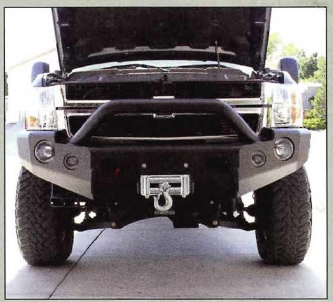
Now it was time to loosely attach the bumper to the frame mounts. TrailReady's mounting system allows for adequate horizontal and vertical adjustment of the bumper for a perfect alignment. The bumper is secured to the frame mount using 8½x1½-inch Grade 8 carriage bolts.