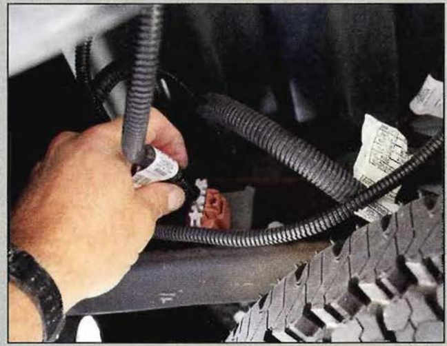
First, I removed the electrical connector for the license plate lights and trailer lights. Then I removed the dual bolt system, which attaches the bumper to the frame and the bolt through the receiver hitch. Repeat for the other side.