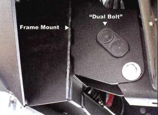
Before the bumper can be installed on the truck, the frame mount is attached to the frame using the OEM dual bolts and hardware provided by TrailReady.