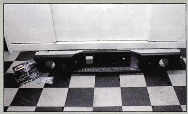
The rear of the truck gets TrailReady's rear bumper, which is constructed pretty much like the front bumper. It also has D-ring mounts for 1-inch shackles. Diamond-extruded aluminum top plates add toughness, while the pair of PIAA 510 Super White driving lights add rear-facing illumination.