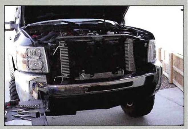
The first order of business was to remove the plastic top cover and grille to gain access to the bolts securing the bumper to the frame. There are eight plastic rivets, which attach the grille to the plastic cover, and six pinch clips. There are also four 10mm head bolts securing the grille to the body of the truck.