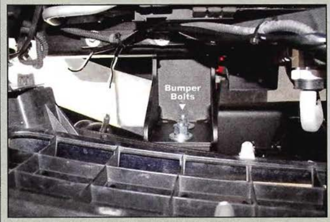
The grille must be in place before the bumper is installed on the truck.