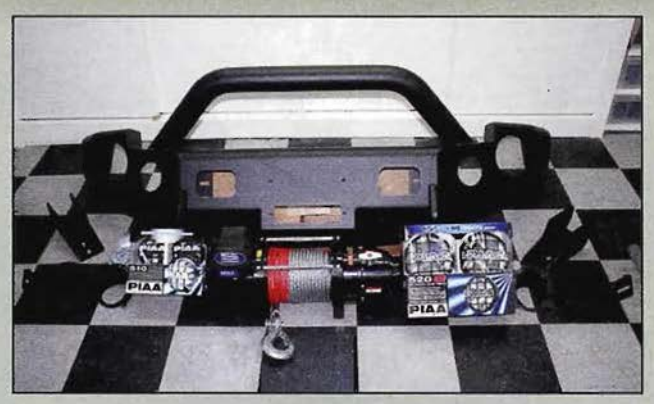
For the front of the truck, we will install TrailReady's extreme-duty front winch bumper made from ¼-inch and \aleph_{e} -inch steel with quad light ports for 4-, 5-, and 6-inch round lights, and D-ring mounts for 1-inch shackles. A Superwinch EP 16.5 winch, a pair of PIAA 520 ATP Xtreme White lights, and a pair of PIAA 510 Super White driving lights will be installed on the bumper.