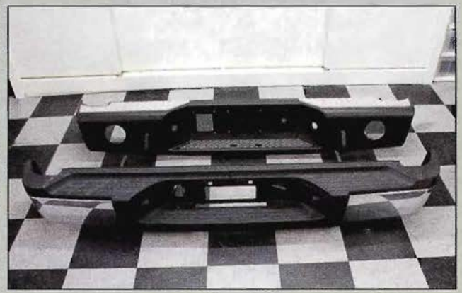
When placed side by side, TrailReady's rear bumper—with its all-steel construction, aluminum diamond-extruded top plate, D-ring, and light ports-makes the DEM look like it should be on a child's toy, not on a heavy-duty truck.