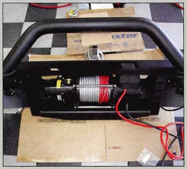
After installing the lights, it was time for the EP 16.5 winch. The bumper is predrilled to accept the 10x4-inch pattern for the roller fairlead. TrailReady's design allows for winches to be mounted footforward or foot down. This is a feature not found in many bumper designs.