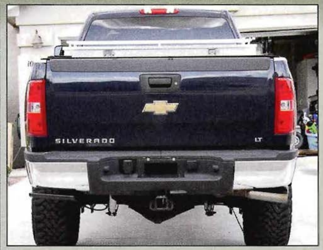
Once the front bumper was installed, I moved to the rear of the truck to finish the project. Removal of the stock bumper was easier and less time-consuming than the front.