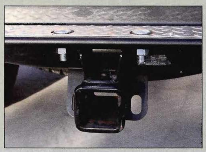
Because TrailReady expects owners to use the functionality of the D-rings on their bumpers, it incorporates extra mounting hardware for the bumper. TrailReady provides two carriage bolts to secure the bumper to the receiver hitch. This makes sure it is securely fastened to the frame and the receiver hitch.