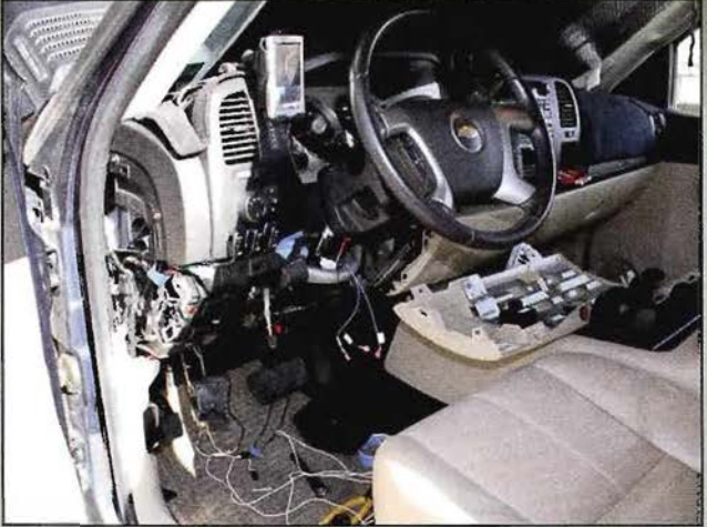
The most time-consuming part of this installation was completing all of the electrical connections. The light kits from PIAA are exceptional. They include everything needed for the installation and the wire harness has multiple connections for ease of installation of the lights, relays, and switch. The control harnesses for the lights are routed into the cab through the firewall and the floorboard.