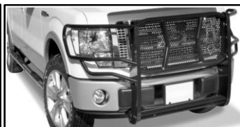
HD GRILLE GUARDS