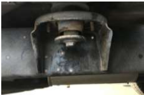
Demount the original nut.