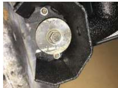
Link the Rocker Panel Guard with the vehicle body, then mount the nut.