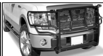
HD GRILLE GUARDS