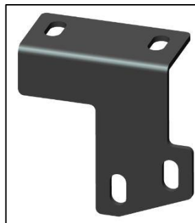
Passenger/right mounting Bracket