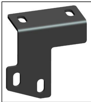
Driver/left Mounting Bracket