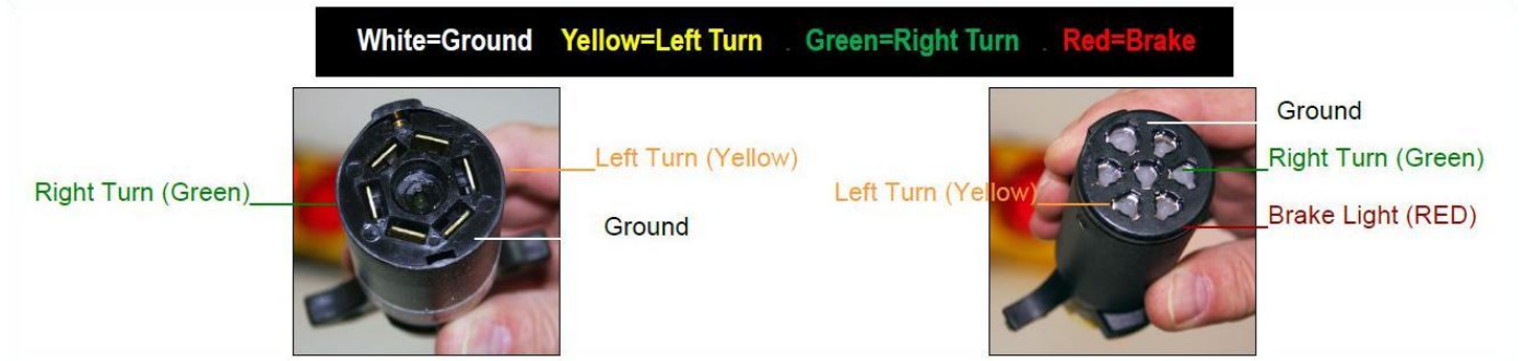
7-Pin RV Style