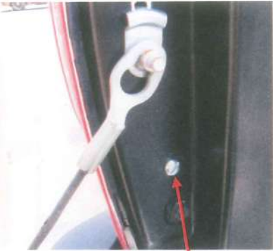
New Taillight Bolt

Remove existing tailgate bolt (SECOND BOLT FROM HINGE) DRIVER SIDE ONLY.