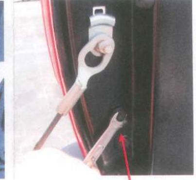
Existing Taillight Bolt