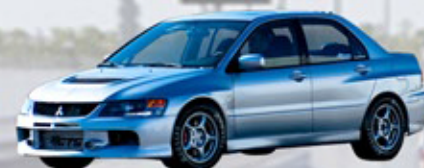
Modern Automotive Performance Mitsubishi EVO