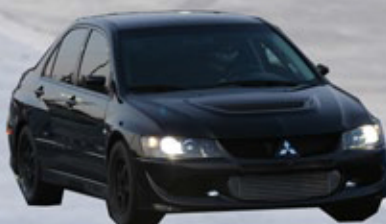
Awd Motorsports Mitsubishi Evo 8.75 @163Mph