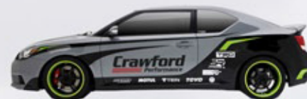
Crawford Performance 2011 Scion TC