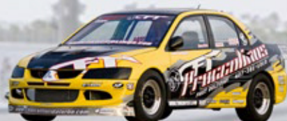
Kings Performance Mitsubishi EVO 8.87 @ 160 Mph