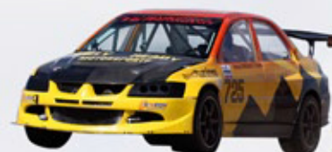
Rally Ready Motorsports Pikes Peak Mitsubishi EVO 08,09,10 Open class Winner