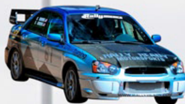
Rally Ready Motorsports Pikes Peak Rally Subaru