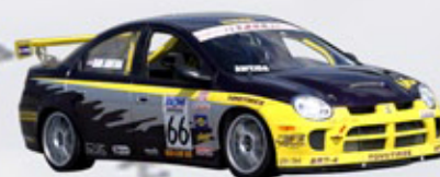
3R Automotive World Challenge Neon Srt-4