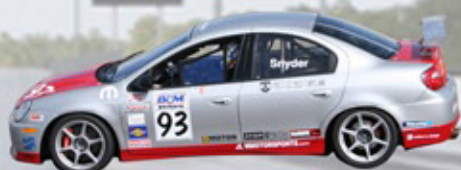
Snyder Motorsports World Challenge Neon Srt-4