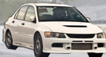
Awd Motorsports World's Quickest Evo Street Car 8.98@156mph