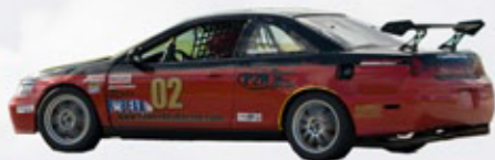
P2R Power Rev Racing FARA MP2-B Honda Accord