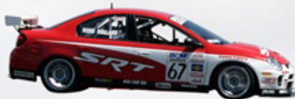
3R Automotive World Challenge Neon Srt-4