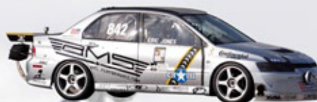
AMS Performance Worlds Fastest Standing Mile Mitsubishi EVO 228 Mph