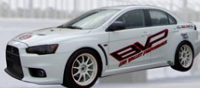
Big Valley Performance