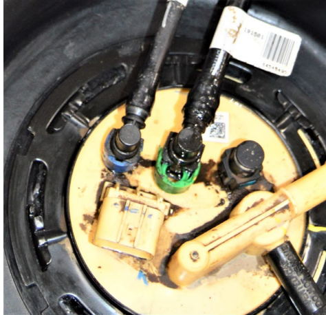
(Fig.2) Disconnect fuel lines at the sending unit using pick.