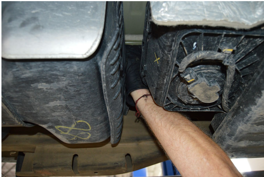
(Fig. 1) Disconnect fuel lines at the front of the OEM tank.