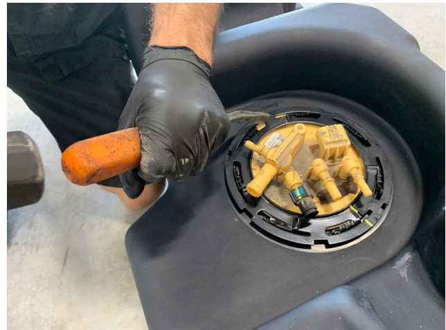
(Fig. 5) Tighten the top TITAN Torque hold-down ring onto the sending unit by turning it clockwise as far as it will go.