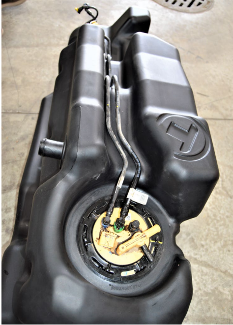
(Fig. 6) New TTITAN tank with fuel lines connected to the sending unit and in place.