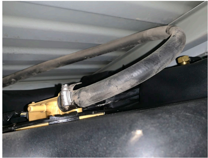
(Fig. 7) Lift tank high enough to reconnect electrical cable and vent hose to sending unit.