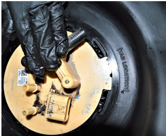
(Fig 4) Line tab on sending unit up with “Tab Location” marks on the TITAN tank.