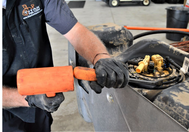
(Fig.3) Loosen hold-down ring on OEM tank by tapping counter-clockwise, remove and lift out sending unit.