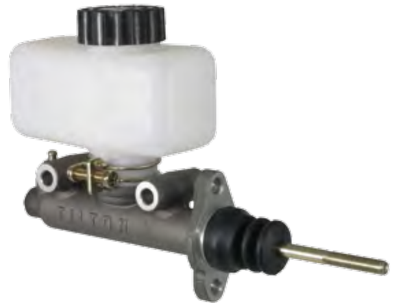
Diagram 1 - Master Cylinder Kit and Replacement Parts