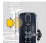
Thule K-Summit XXL

Even for vehicles with minimal wheel clearance*