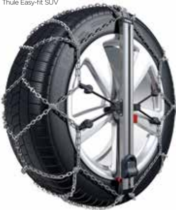
Thule Easy-fit SUV

The quickest snow chain to fit in the world. Holder of the Guinness World Record™. Innovation, design and safety. Winner of the "IF Design Award 2013" and of the "International Grands Prix for Automotive Innovation" - Equip Auto - Paris 2011.