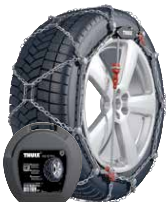
Thule XG-12 PRO

Snow chains that tighten automatically when you set off. Quick fitting: fit the chain and set off with no worries!