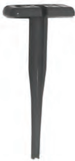
Part No. 582

Deutsch terminals and connectors are found on Chrysler, GM, AGCO, John Deere, Case, Bobcat, Caterpillar, Harley Davidson, Mercury outboards, Kenworth, Peterbuilt, White and other HD applications.