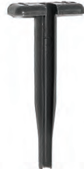
Part No. 584

Lt. Blue plastic tool fits 16-18 gauge wire sizes. Now available in a convenient package of three.