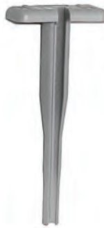
Part No. 583

Red plastic tool fits 20-24 gauge wire sizes. Now available in a convenient package of three.