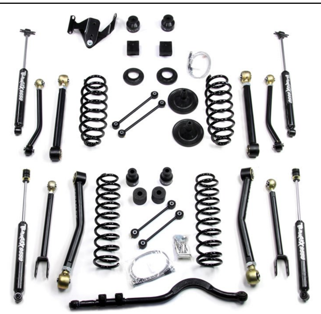
4" Short Arm Lift Box Contents at a Glance