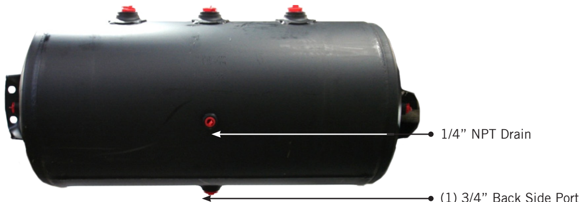
Bottom view note three 3/4" ports front & one 3/4" port back side

Air tanks meet SAE J10 and FMVSS DOT 121 for use in heavy duty air brake systems.