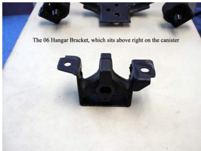
The 06 Hangar Bracket, which sits above right on the canister