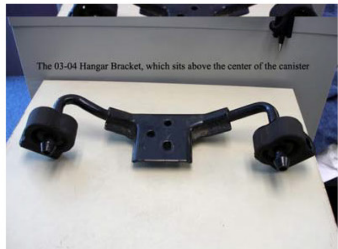
The 03-04 Hangar Bracket, which sits above the center of the canister

Tanabe Medalion Touring, Part number T70082 is designed for installation with the 2003–2004 Infiniti G35 Sedan hangar bracket. 2005–2006 Infiniti G35 Sedans will require the purchase of the 2003–2004 exhaust mounting assembly, shown above.