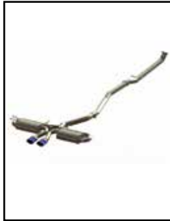
(Coupe) Exhaust Cat-Back

P/N: 49-36618-L (Blue Tips) 49-36618-P (Pol. Tips) 49-36618-C (C/F Tips)