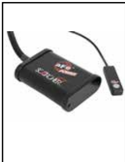
SCORCHER GT Module