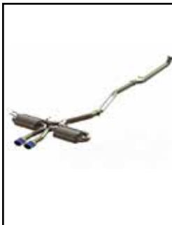
(Sedan) Exhaust Cat-Back

P/N: 49-36621-L (Blue Tips) 49-36621-P (Pol. Tips) 49-36621-C (C/F Tips)