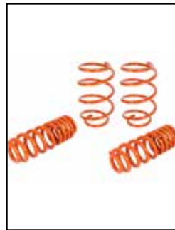
aFe Control Lowering Springs