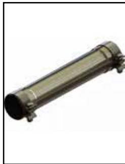
Test Pipe/Delete Pipe