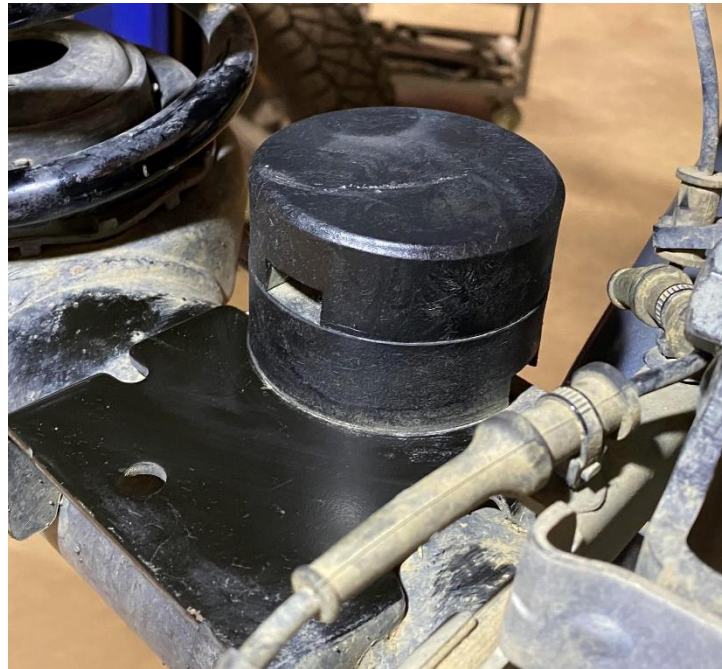
Figure 4. Rear Bump Stop Correctly Installed on JL Wrangler