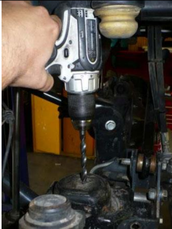
Figure 1. Drilling 3/8” Hole in Coil Perch/Bump Stop Pad