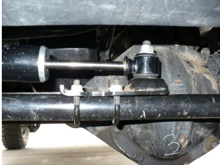
Figure 2. Factory Tie Rod Bracket ‘Flipped’