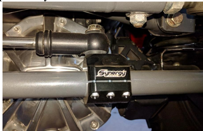
Figure 3. Synergy 8003-20 Clamp Installed On Tie Rod