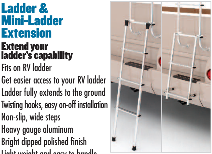
503L | Ladder Extension 504L | Mini-Ladder Extension

501L | Hinged RV Ladder 502L | Straight RV Ladder