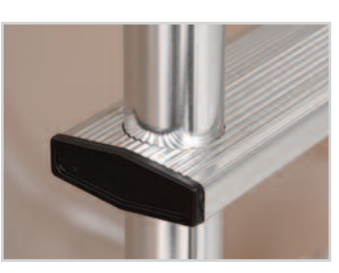
Wide Steps Non-slip texture