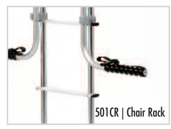
Chair Rack Pivoting Arms Allow easy access to use the ladder

Safety pin securely holds rack in open or closed position.