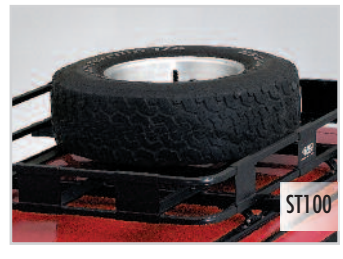
Spare Tire Adapter Keep your spare in the air