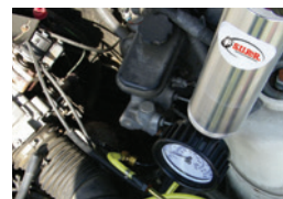
Fuel injection cleaner connected to inline Schrader valve