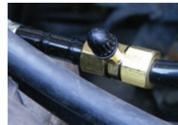
Nylon fuel line with inline Schrader valve