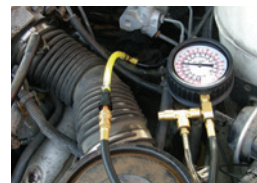
Fuel pressure tester connected to inline Schrader valve