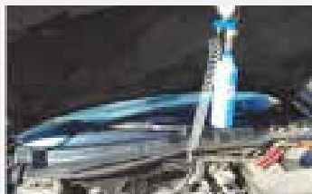
Easily connects to vacuum line