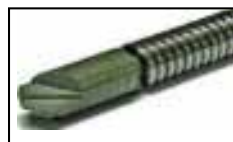
Heat-treated tip rips through carbon deposits