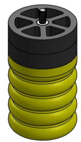
BOTH SPACERS INSTALLED WITH 90MM BOLT