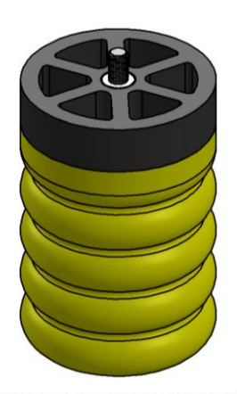
SINGLE SPACER INSTALLED WITH 60MM BOLT