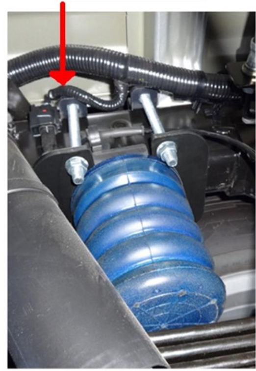
Bracket installation view inside of frame