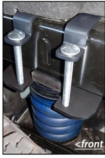
Driver's side top view