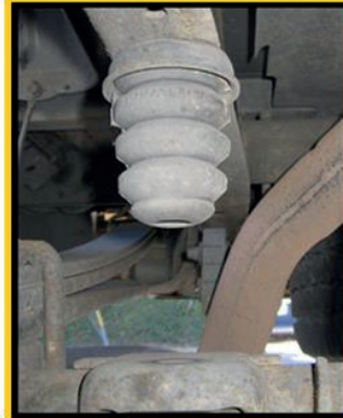
Older 2x4 OE bumpstop