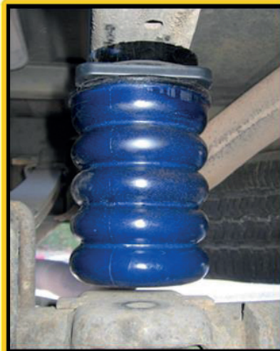
SSR-209-40 with urethane spacer on older 2x4