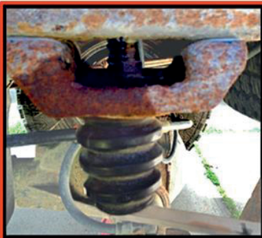
Older model 4x4 OE bumpstop with bracket