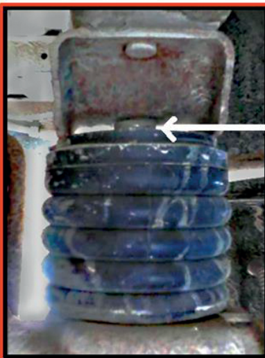
SSR-209-40 heavily loaded

Use supplied washers with older 4x4 installations