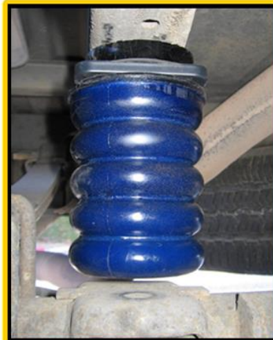
SSR-209-40 with urethane spacer on older 2x4