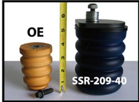
Extra Heavy Duty