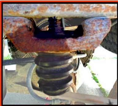
Older model 4x4 OE bumpstop with bracket