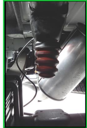
Late model 2x4, 4x4 OE bumpstop with bracket extender