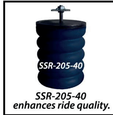
SSR-205-40 enhances ride quality.