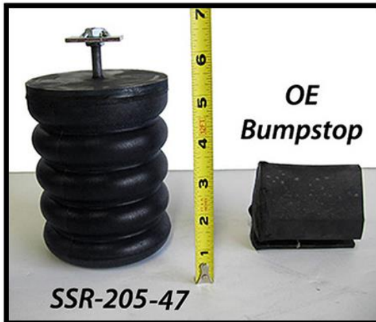
SSR-205-47 is the medium duty option.