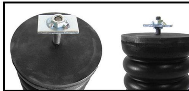
Insert plate into sideways slot at rear. To install, turn jounce counterclockwise