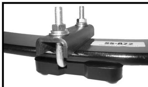
Polyurethane Mounting Kit Assembly