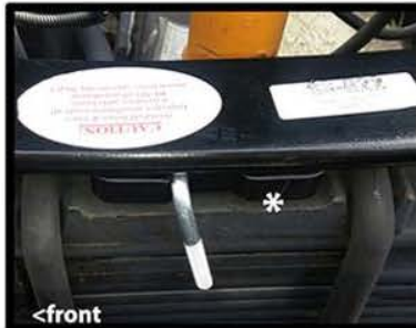
Place PSP-19 on top of spring plate flat side up facing, with groove toward the front