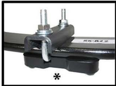
PSP-19 with hold-down clamp assembly