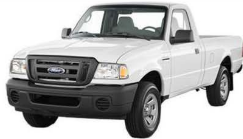
Mounting Kit included