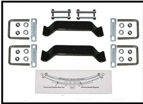
SuperSprings Mounting Kit # MTKT Installed →