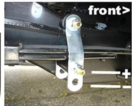
set spring pre-load & ride height