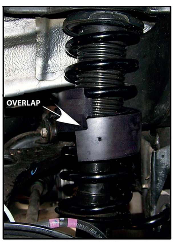
Installed on a 2011 Outback To complete installation install nylon wire ties