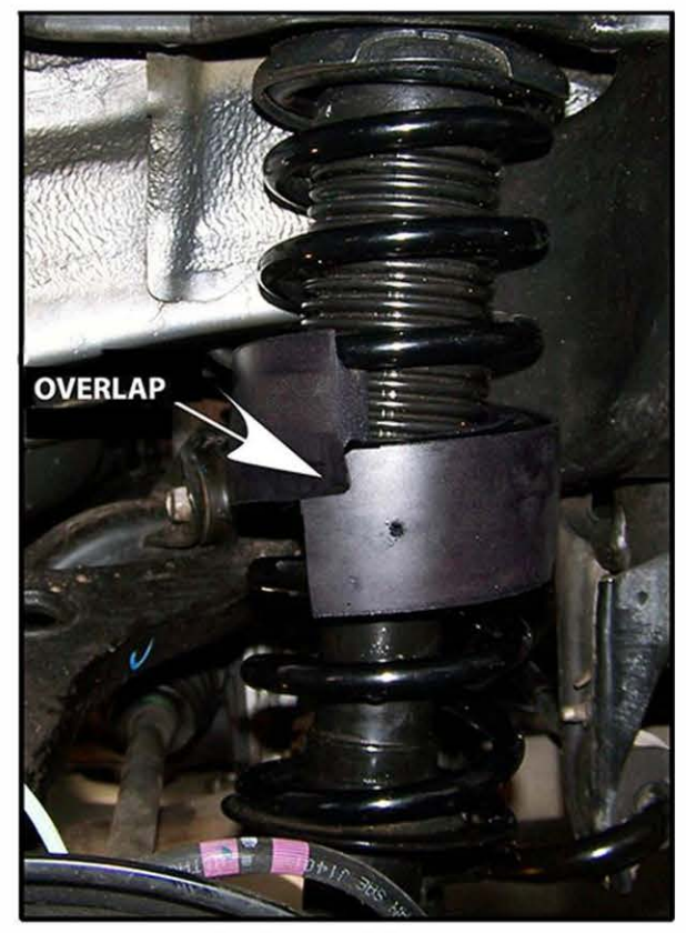
Installed on a 2011 Outback To complete installation install nylon wire ties

SumoSprings installation possible with or without removal of strut from the vehicle.