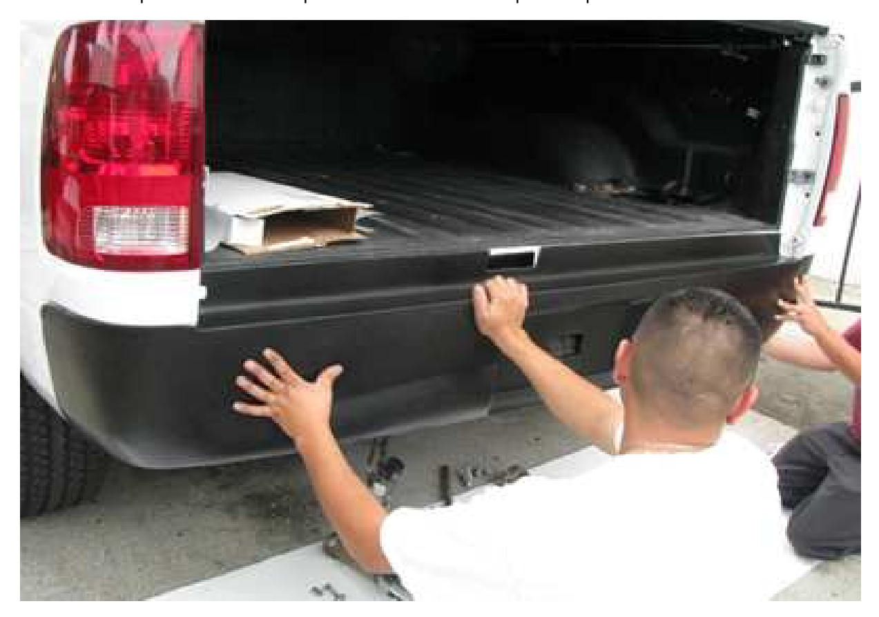
pull the backing off of the two sided tape. At the same time keep pressure where the tape goes. Go across the top first then do the sides.

7. A second person would be helpful in installation. Set roll pan into position and