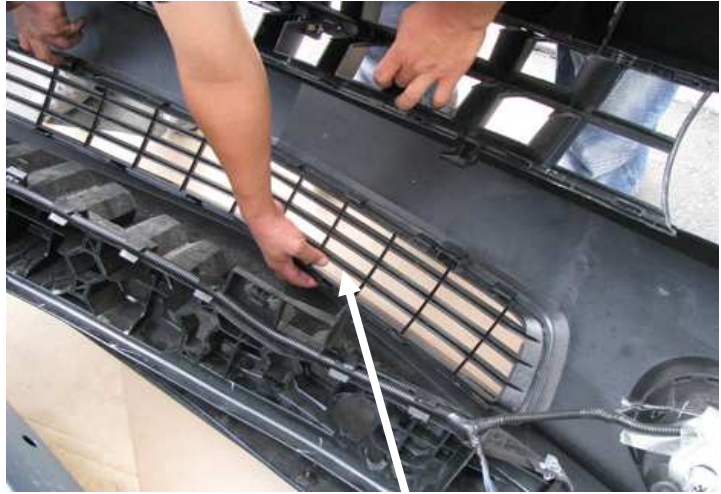
STOCK LOWER GRILLE INSERT

6. The lower valance stock grille will just pull out by unfastening the mounting tabs.