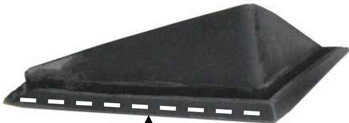
Bottom Of Grille Duct

7. Next is to install the grille ducts, You only will have to use the two sided tape for this. See below for tape line.