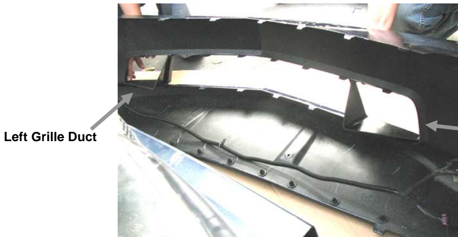
Left Grille Duct