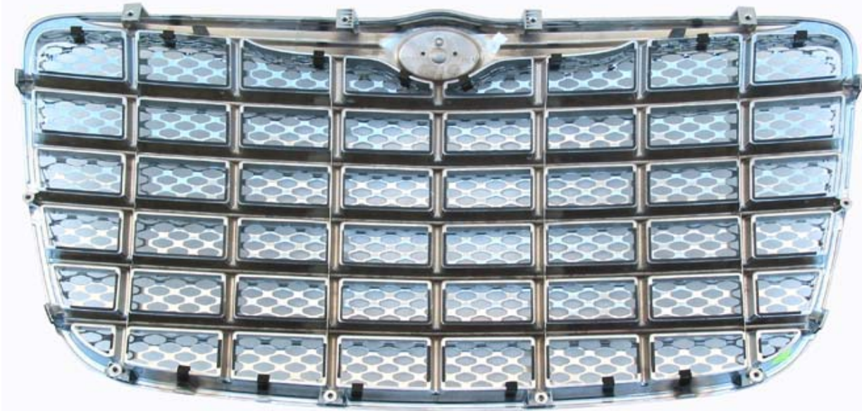
PHOTO FOR CLIP PLACEMENT

Install the grille shell back into vehicle in the reverse order of removal. DO NOT over tighten the fasteners that go into the Styrofoam.