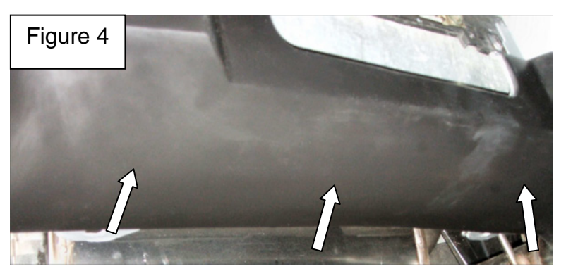
Page 2 of 2