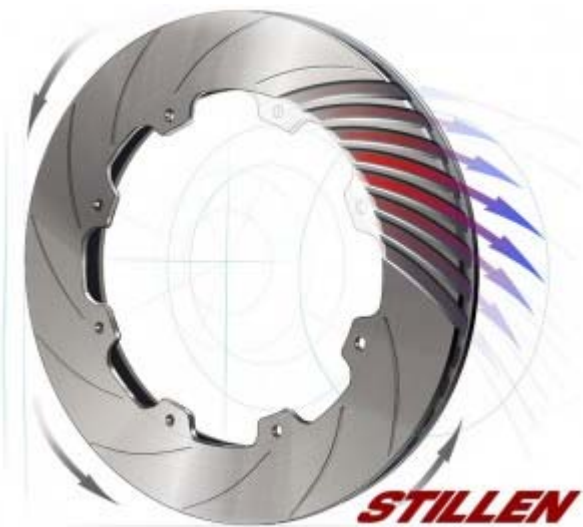
Diagram of STILLEN Rotors

How did we get these results? Here's the methodology we used.