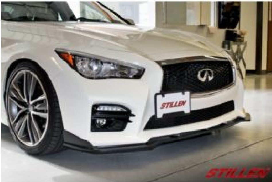
The new 2016 Infiniti Q50 is the perfect blend of performance and luxury.

We here at STILLEN recognize that many Infiniti Q50 owners are chomping at the bit to upgrade their new vehicles' performance and aesthetics. Well, you asked for it, and we delivered! STILLEN is proud to announce a new line of products for the 2016 Infiniti Q50 2.0t, consisting of exhaust systems, body components, and handling parts that are sure to help this new sport sedan truly live up to its full potential.