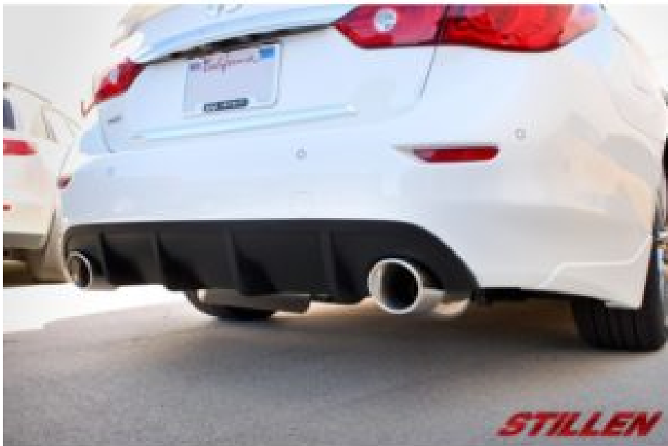
The STILLEN rear diffuser pairs nicely with the STILLEN exhaust system on the 2016 Infiniti Q50 2.0t.