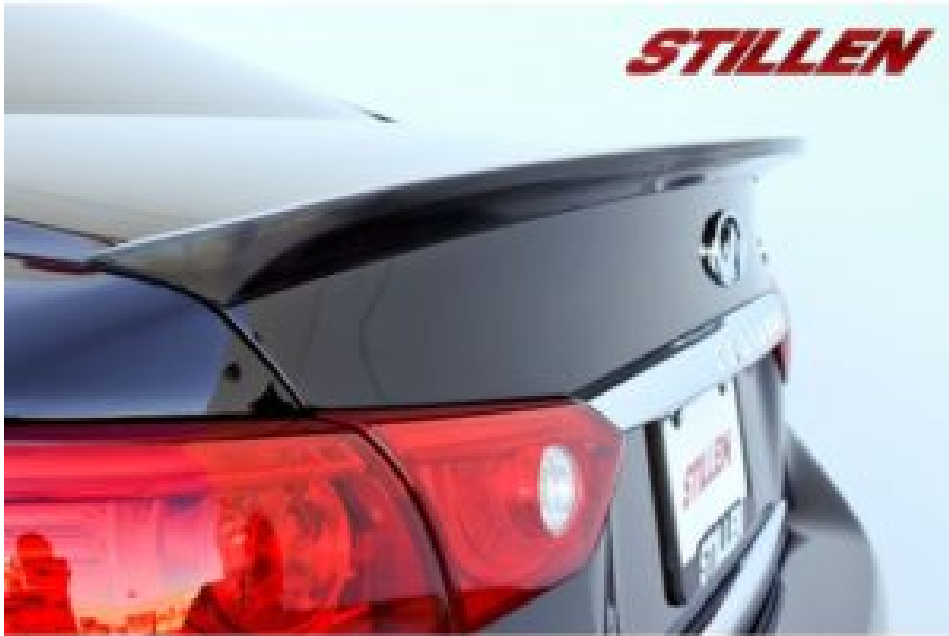
The new rear trunk spoiler for the 2016 Q50 juts out assertively, giving your car an aggressive look.